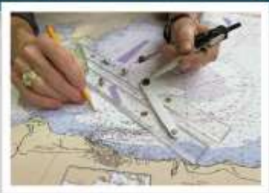
Exclusive Pacific Northwest Charts!

Experience the Flagship Difference for yourself – enroll today!