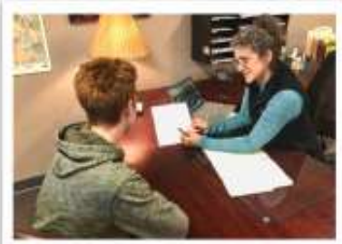
In house credentialing included with tuition!