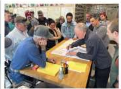
In-person, hands-on, classroom training!